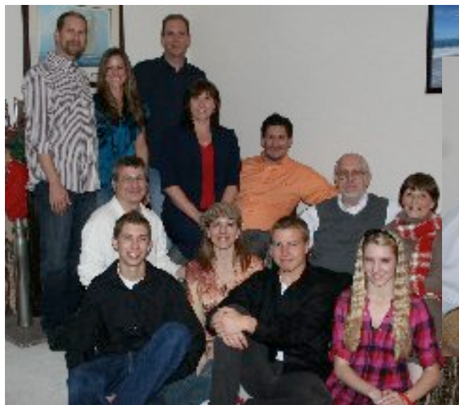
WONDERFUL CHRISTMAS WITH ALL OUR FAMILY