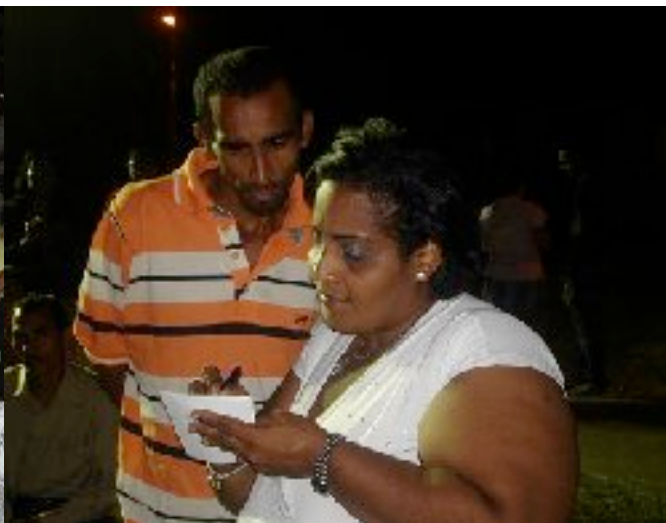
TAKING INFORMATION OF NEW BELIEVER