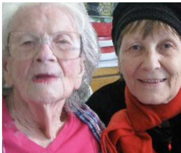
"GRANNY" AT 98 WILL OUTLIVE US ALL