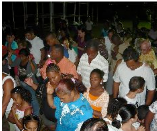
DECISIONS FOR CHRIST ON 1ST NIGHT OF CRUSADE IN PANAMA

Tonight will be the fourth night of our Crusade in Panama. Rigo reports God is blessing in a great way (see pictures and details below).