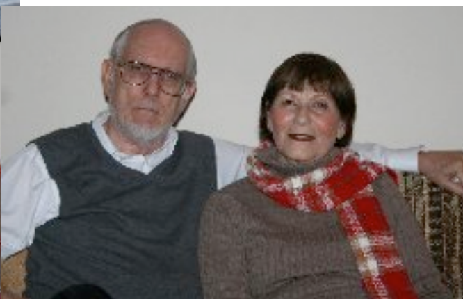
STILL ALIVE AND KICKING THREE MONTHS AFTER OPEN HEART SURGERY