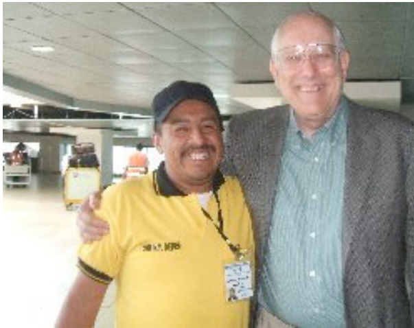
HECTOR, SON IN THE LORD WE WILL SEE ON THIS TRIP