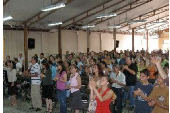
PEREZ ZELEDON, COSTA RICA CHURCH THAT IS CONTINUING TO PRAY FOR REVIVAL

By the time some of you read this, I will be on a plane flying to Costa Rica to preach a series of meetings in a church that is "ready to see revival." They have a two-hour prayer meeting every day. PLEASE PRAY!!