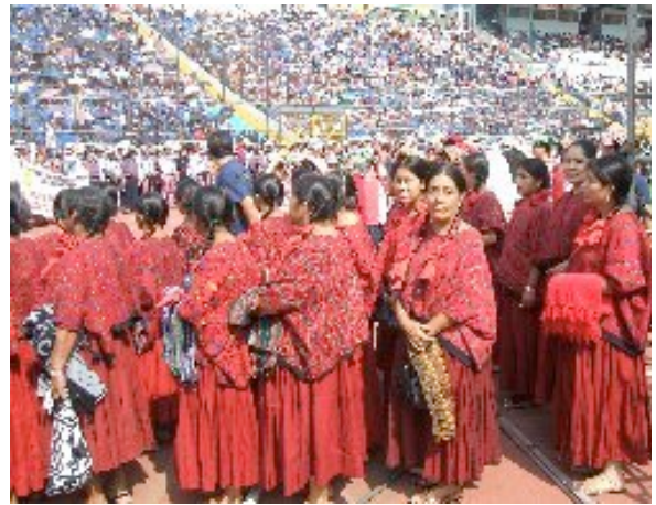
40,000 REMEMBERING ONLY REVIVAL IN LATINA AMERICAN HISTORY-"HAZLO OTRA VEZ"