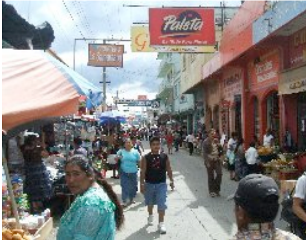
MARKET PLACE OF HUEHUETENANGO, GUATEMALA