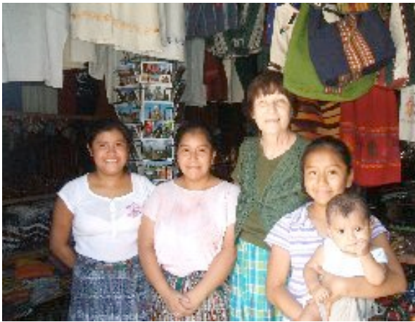
CHRISTIAN FAMILY IN REMOTE AREA OF GUATEMALA THAT SAID "WE SAW YOU BOTH ON TV"

Dear Prayer Partners, Friends, and Loved Ones, Saturday July 25, 2009