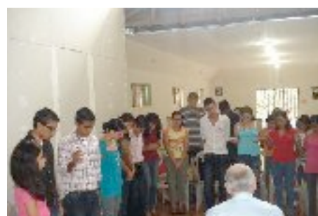
WITH YOUNG PEOPLE WHO ALREADY TESTIFY OF THEIR LOVE FOR JESUS

Almost with each new trip we see God increase His blessing on our ministry. He has brought much conviction and repentance on congregations, which has resulted in a deeper love for Him and has made many become witnesses of His love.