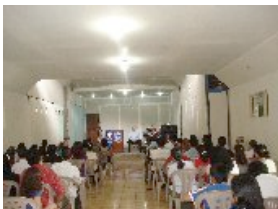
PALMICHAL: MUCH CONFESSION AND MANY ASKING EACH OTHER FOR FORGIVENESS