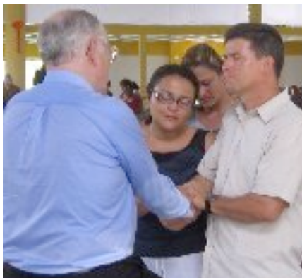
PRAYING WITH GODLY COUPLE WHO ARE FACING SERIOUS HEALTH ISSUES