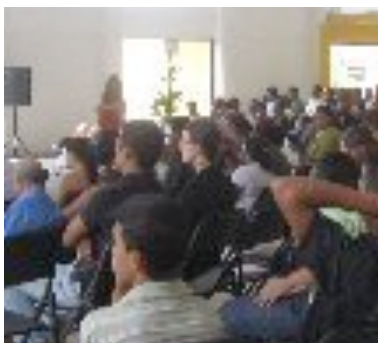
PARRITA: WHERE GOD BROUGHT MUCH CONVICTION AND BLESSING